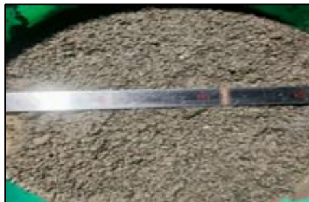
Cuttings from the Shale Shaker clearly showing preserved condition, normal-dry