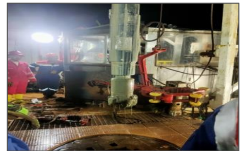
The trip out at TD was smooth, with no over-pull and clean BHA observed at surface. Casing was run to bottom and set with no issues.